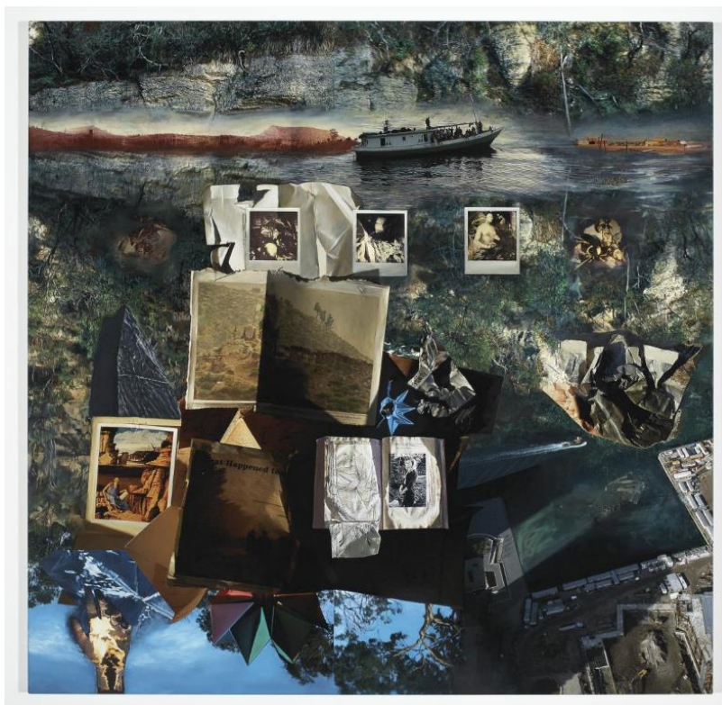
Figure 1. Lyndell Brown and Charles Green, The Dark Wood , 2011, digital print and oil on canvas, 121 × 121 cm.

in 2014, has a long association with the military. All four produce artworks (placed in national collections) and, as academics (at the University of Melbourne and RMIT University, Melbourne), reflect deeply (and publish widely) on the heritage of conflict and war by interrogating contemporary art's representations of war, conflict and terror (Brown and Green 2008).