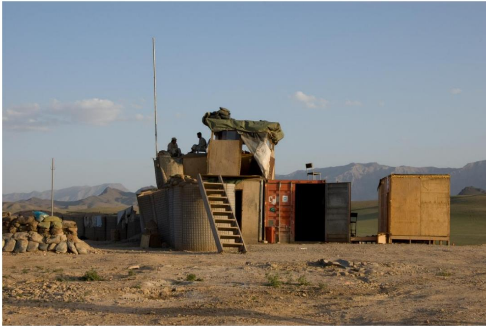
Figure 6. Lyndell Brown and Charles Green, Afghan National Army Perimeter Post with Chair, Tarin Kowt, Uruzgan Province, Afghanistan, 2007–2008 , editioned digital colour photograph, inkjet print on rag paper, 111.5 × 151.5 cm. Collection National Gallery of Victoria.

Few have defined the diffuse spatiality of the post-modern battlefield better than Australian War Memorial curator Warwick Heywood: