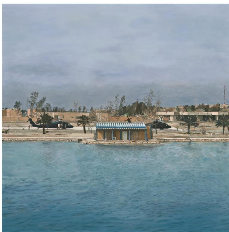
Figure 4. Lyndell Brown and Charles Green, The Dark Palace 1 , 2011, oil on linen, 151 × 151 cm. Private collection.

Their response to their period in and around the 'front' line was a suite of contemplative, realist paintings and, by contrast, painterly photographs of the paraphernalia and infrastructure of a nebulous new warfare—huge bases, hardware technologies, fleets of armoured vehicles, soldiers preparing for patrol. In one painting a troupe of American drone pilots high in the Afghan mountains proudly showed off their weird craft; in another a squadron of attack helicopters is neatly parked inside a huge compound, immortalized in The Dark Palace 1 , 2011 (Figure 4). At the intersection of landscape, culture, and technology, these gravely quiet, almost frozen fragments of conflict were, as the artists noted, 'a portrait of force, of the hard edge of globalisation' (Brown and Green 2008).