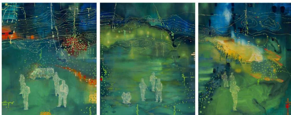
Figure 3. Jon Cattapan, Night Figures (Gleno) , 2009, oil and acrylic on linen, 180 × 250 cm. Private Collection.

This foreboding mood informed the cycle of paintings made on his return to Melbourne. The large and highly significant triptych, Night Patrols, Maliana (2009), is a compendium work that conflates many of the patrols and nocturnal places into something of a spectral gathering. We see similar pictorial concerns addressed in the triptych Night Figures, Gleno (Figure 3). 'The paintings in this series,' one reviewer wrote, 'are imbued with notions of anxiety and surveillance, and evoke in the viewer feelings of voyeurism and invasion of privacy.' The soldiers are observers but are also being observed. As they roam the benighted villages they too are being scrutinised and followed by unseen eyes. Luminous and larger than life, the soldiers seem at odds with the unfamiliar land, with its uncanny vivid greens and tracery of dots and lines. Every effort at integration and communication seems to be frustrated by their very alien presence, accentuated by their virulent painterly difference (Green et al. 2015, pp. 168–73).