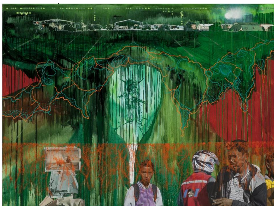
Figure 5. Lyndell Brown/Charles Green and Jon Cattapan, Spook Country (Maliana) , 2014, oil and acrylic on linen, 185 × 250 cm. Private collection.