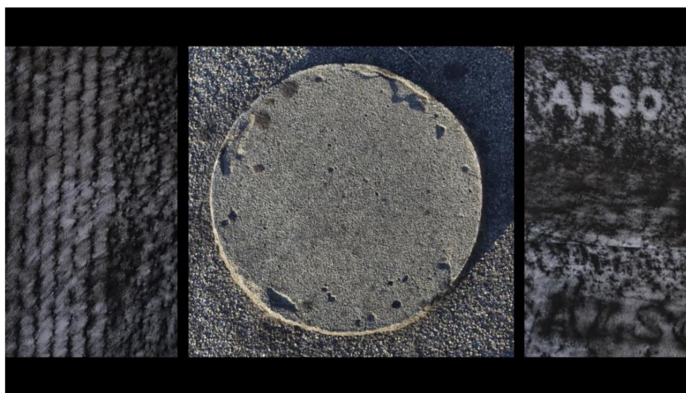
Figure 8. Paul Gough, Stoneology no. viii , 2017, charcoal, photo-montage and collage, 40 × 120 cm.