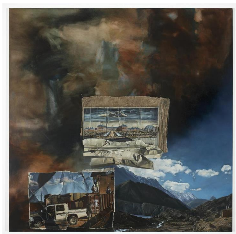
Figure 2. Lyndell Brown and Charles Green, Outpost , 2011, oil on linen, 170 × 170 cm.