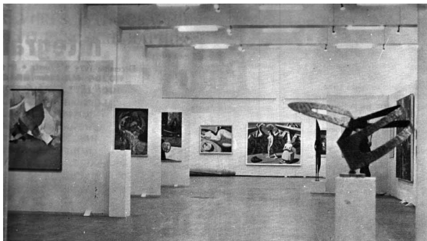
Installation view of the 1st Arab Art Biennial, 1974, as published in Intégrale: Revue de création plastique et littéraire , December 1974, p 4