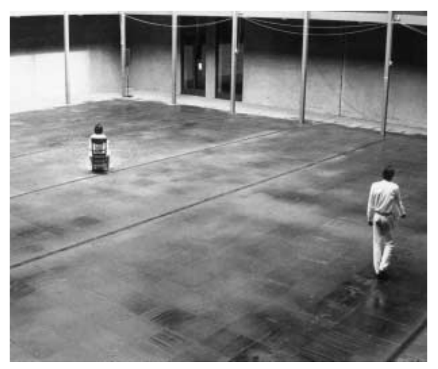
Marina Abramovic/Ulay, Go ... stop ... Back ... stop, 1979, action (duration 1.5 hours), National Gallery of Victoria, Melbourne.

This work then became the first instalment of an all-inclusive ninety-day work spanning several times and places, Nightsea Crossing (1981–86), rather than a work in itself.