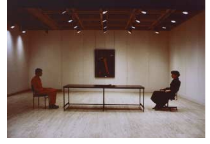
Marina Abramovic/Ulay, Gold Found by the Artists , 1981, action (duration 16 days), Art Gallery of New South Wales, Sydney.

4. Abramovic's biographical entry for that year read: 'EXPERIMENTS WITHOUT EATING AND TALKING FOR LONG PERIODS OF TIME MEETING TIBETANS NIGHTSEA CROSSING PERFORMANCE BE OUIET STILL AND SOLITARY THE WORLD WILL ROLL IN ECSTASY AT YOUR FEET EATING HONEY ANTS, GRASS HOPPERS ANIMA MUNDI WOUNDED SNAKE MEN MISSING BOOMERANG SLOW MOTION.' Abramovic, Biography, p 41; Abramovic and Ulay separately observed: 'M. The desert reduces yourself to yourself, that's all that happens. U. You are alone.' Phipps, 'Abramovic/Ulay/...', op cit, p 47.